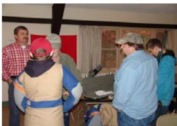
total Air shooters