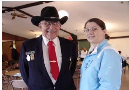
40 Apprx. # per Classes