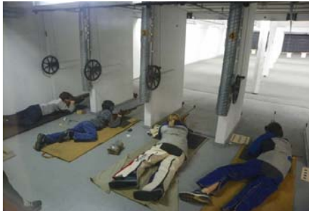
total SJ shooters